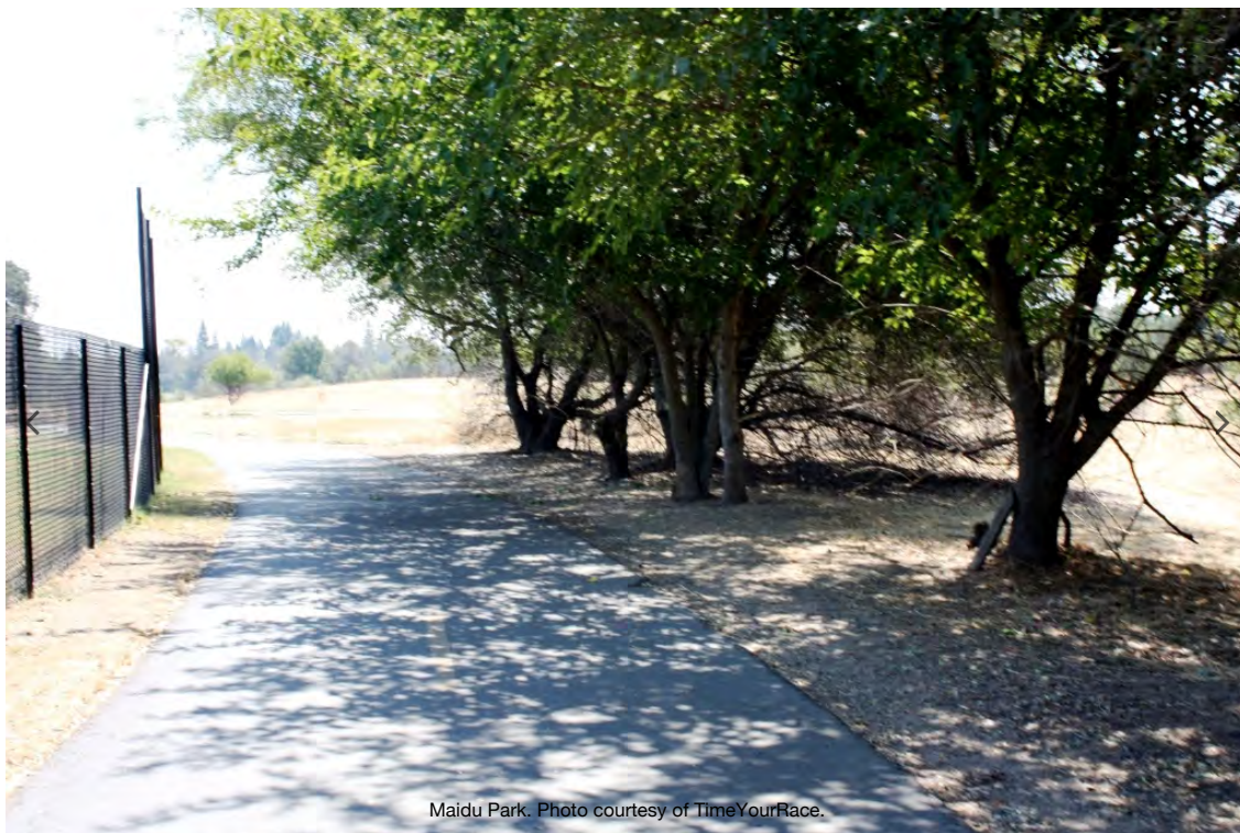
Maidu Park.

🌐 www.roseville.ca.us/parks (http://www.roseville.ca.us/parks/)