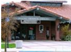
Maidu Library 1530 Maidu Drive, 95661