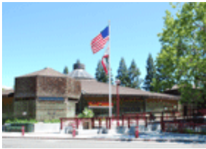
Downtown Library 225 Taylor Street, 95678