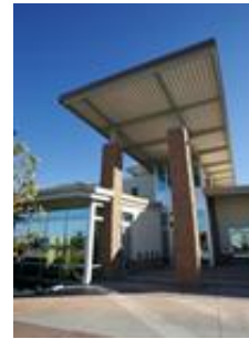
Martha Riley Community Library 1501 Pleasant Grove Boulevard, 95747