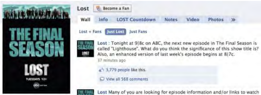
The official "Lost" Facebook Page.

For example, I am an avid watcher of the American TV show "Lost" on ABC. By connecting with the official Facebook Page for "Lost" , I can keep up on the latest episodes and other information directly from the people behind it.