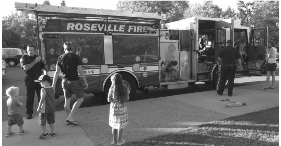
Fire Department fans check out a fire engine from our local station at the 2016 National Night Out for Maidu Neighbors.

Feedback or Questions? Email us at feedback(at)maiduna.com