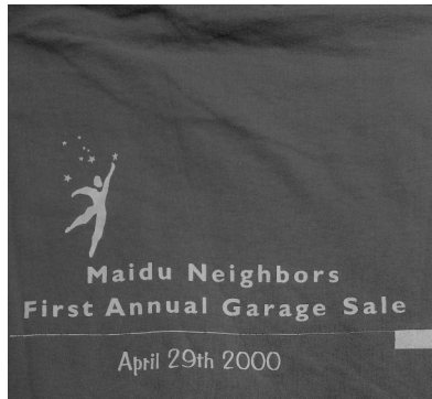
Front of 1st Garage Sale t-shirt

Finally the day arrived. The weather was sunny. In addition to the homes around the neighborhood who participated in that first Sale, the Neighborhood Association had arranged for an information fair at Willard Dietrich Park. The City's Environmental Utilities department, Fire department, and some local businesses had displays for neighbors to visit. We had the fair again a year or two more, but found there was low attendance so it was abandoned for the annual Garage Sales since.