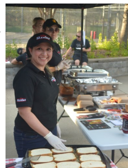
The Sizzler crew