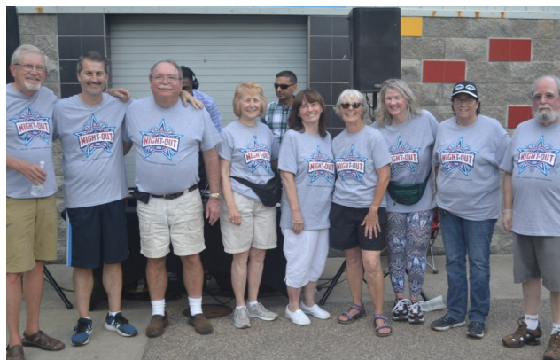
Maidu NA Board members and volunteers who helped.