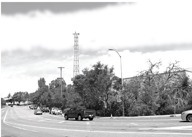
Mock-up of approximately what the radio tower would look like viewing it from the low end of Straunch Drive (near Rocky Ridge).

Funding for this project is $1.5 million dollars and provided by designated capital improvement project funding.