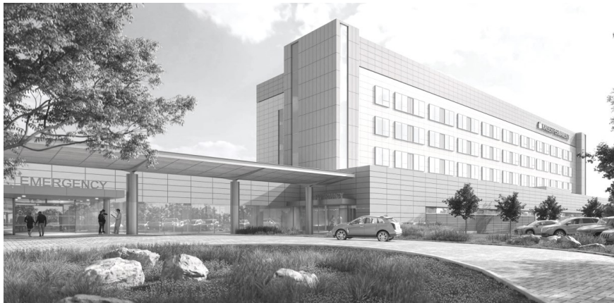
Mock-up of Kaiser’s proposed 138-bed Inpatient building, to be located near where the Emergency Department entrance is today.

The existing Kaiser campus, bounded by Douglas Boulevard, Rocky Ridge Drive, Lead Hill Boulevard, and Eureka Road, is planning to add a 278,000 square-foot, six-story, 138-bed Inpatient Tower building near the corner of Rocky Ridge and Lead Hill Boulevard. They also plan to add a new four-level garage with rooftop parking to accommodate approximately 800 stalls near the corner of Lead Hill Boulevard and Eureka Road.