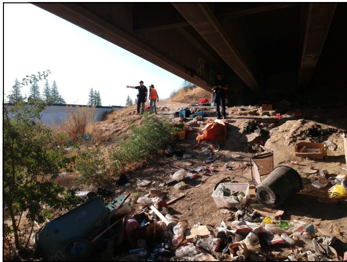
Roseville Police Officer points to an area to be worked while near Vernon Street bridge over Dry Creek and debris.

On Thursday, September 8, 2022 the Roseville Police Social Services Unit, Roseville Parks and Recreation and Roseville Code Enforcement completed a multi-day clean-up of the 1600 block of Vernon St near Dry Creek. This is the part of Vernon that is much closer to Cirby Way at Foothills Boulevard than Douglas Boulevard.