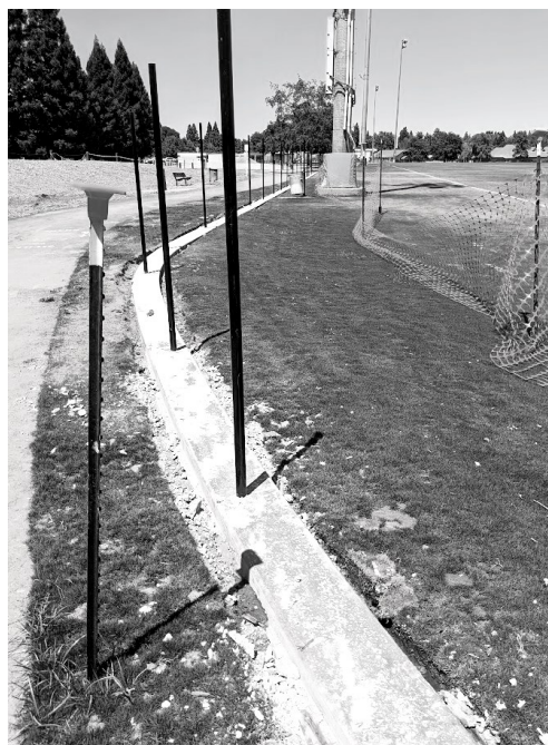
This shows the concrete footing and poles in place before chain link is added to finish fencing around the soccer fields.

As of this writing, the fencing has been completed. There are several open gates around the parameter of the fields. It is somewhat less convenient to access the fields as you have to go to a gate rather than walking onto the field at any point, but this seems like a reasonable sacrifice in order to assure the fields are well-treated.