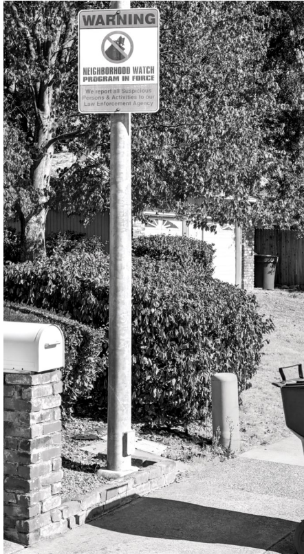
A Neighborhood Watch sign in our neighborhood

We urge you to check out the site and seriously consider forming your own Neighborhood Watch. It can be