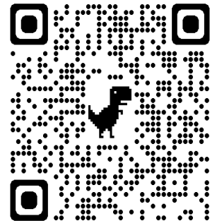
Link to City's Neighborhood Watch page

If you already have a Neighborhood Watch with your neighbors or have questions about how to get started, we welcome you to come to the next Maidu Association meeting, Tuesday, August 22nd, to share your experiences and questions. Together we can all make and keep Roseville safe and enjoyable.