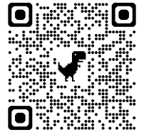
City's Santa Map

Santa will start at Maidu Park and immediately cross Rocky Ridge into the South Cirby neighborhood starting at 6 p.m., so we will have to be patient while he rides through that neighborhood. Once finished there, he will drive past Oakmont High School and come along South Cirby Way until he turns into our neighborhood at Champion Oaks Drive. He will slowly parade along Champion Oaks until he gets to North Cirby where he turns in the direction of Sargeant School and neighboring Willard Dietrich Park where we will gather, starting at 6 p.m.