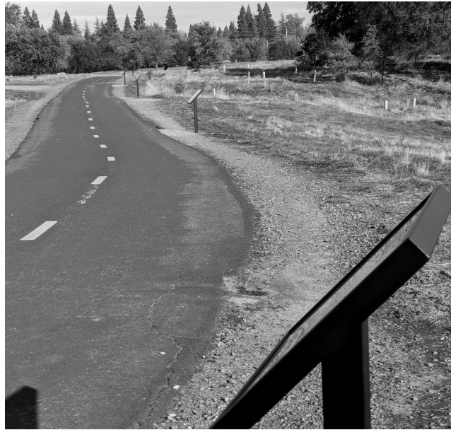
The trail, with Story Walk signs at right, line part of the trail in the natural side of Maidu Park.

I would like to see this trail free from development. The story walk is too much. My firm belief is that story walk needs to be placed where children are; for example, by the big playground or along the soccer field fences. There are so many other locations that would be suitable. I have contacted the City Parks, Recreation and Libraries Department by telephone at (916) 772-7529 and by email to let them know my concern about story walk and my goal to have them moved to a better location. I can be reached at (916) 955-1909 if you wish to share your thoughts.