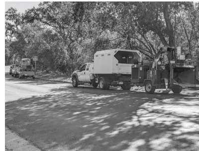
City workers show up to clean up

About a month after I submitted the request, I was walking past the area and saw City employees working to clear the Ravine. The next day I looked, and all the debris was gone.