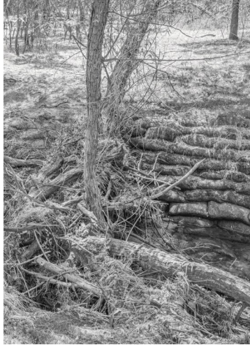
Logs and debris block Strap Ravine at left.

Last fall, while walking on the south side of Maidu Park, I noticed that a natural dam had been created in Strap Ravine where a tree fell into it. There was almost no water in the Ravine at the time, but I knew that in the coming winter it could be a different story.