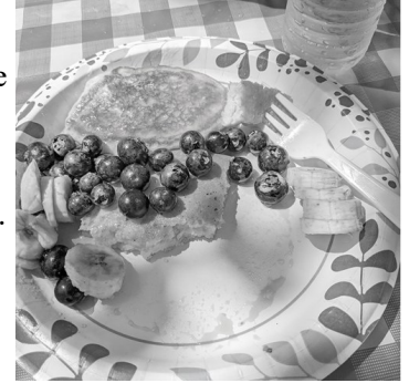
Blueberries, pancakes, syrup

Some of our local merchants are participating by donating food for the event to keep costs down. We will be thanking those merchants in our next monthly newsletter.