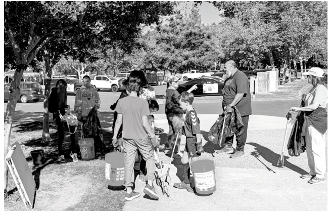
Park Clean-up volunteers grab gear to prepare to fan out across the Park's natural areas and find trash.

A small but enthusiastic group of neighbors including families with kids arrived in the bright morning sunshine at Maidu Park by the pavilion and selected gear to use for the clean-up. Many anticipated what would be needed and brought their own gloves and trash grabbers, and the Association was able to provide more grabbers, buckets, and the City provided the all important trash bags. After receiving brief safety instructions, everyone fanned out to collect trash in the natural area of their choosing.