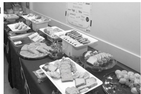
Treats at 2025 'Sweet Celebration'

Our parent organization, the Roseville Coalition of Neighborhood Associations (RCONA) is having a fundraising event Thursday, April 16th, 6-9 p.m. at Johnson Hall at TheGrounds. As they describe it, "RCONA's 2nd annual Sweet Celebrations honors the incredible volunteers who help make Roseville a great place to live. Guests can enjoy finger foods and sweet treats from more than a dozen local businesses, plus browse a variety of silent auction items."