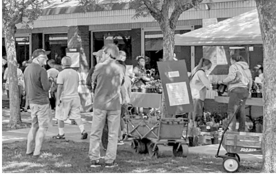
Gardeners of all types attend Plant Sale.

Add a stop to the Roseville Better Gardens Club (RBGC) Plant Sale Fundraiser as you enjoy visiting the garage sales for our neighborhood. The Plant Sale is located at the Maidu Community Center (entrance sidewalk), 1550 Maidu Dr. from 10AM-2PM.